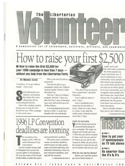
The Libertarian Party's newsletter for volunteers, activists, officers, and candidates. This issue is dated Fall/Winter 1995.

2011: The Libertarian National Committee begins raising money to buy a building for the LP Headquarters.